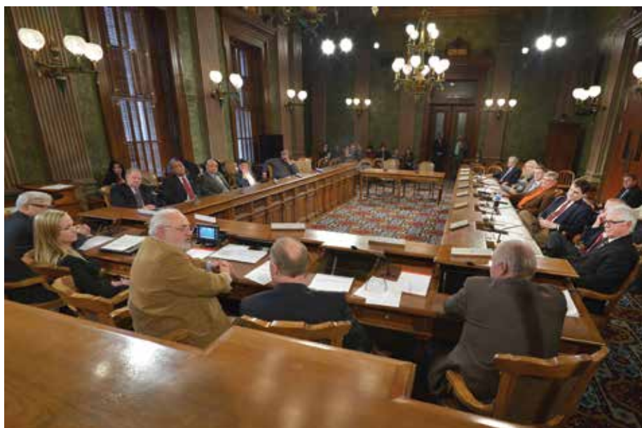
Senate members discuss legislation during a recent meeting of the Appropriations Committee.