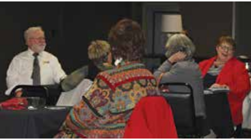
Ambassadors report on their meetings with legislators.